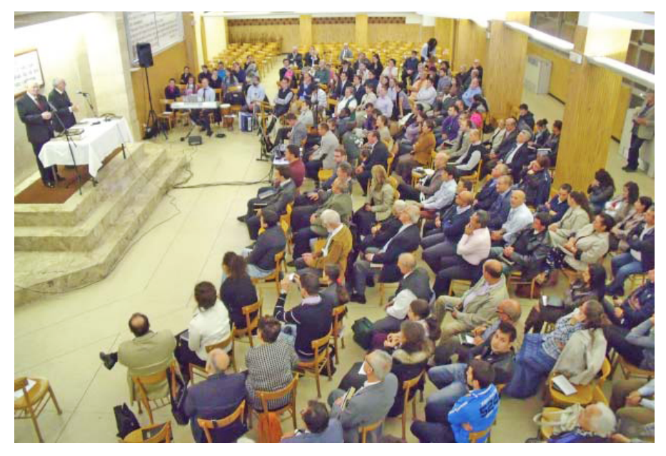
The meeting in Rome, Italy