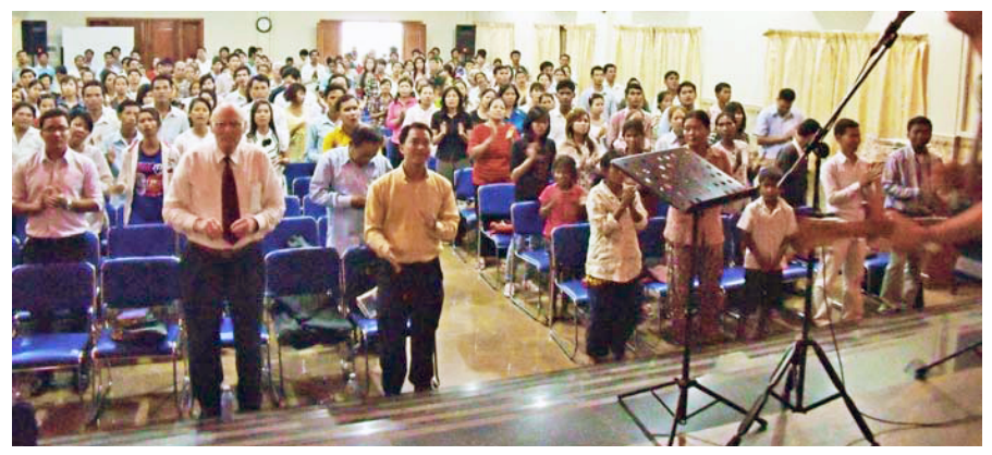
A photograph from Phnom Penh, Cambodia