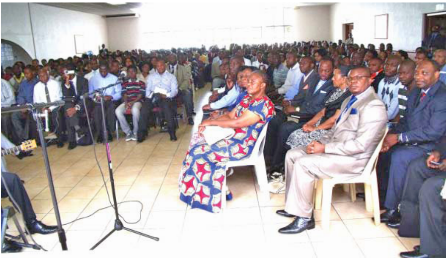
The meeting in Johannesburg