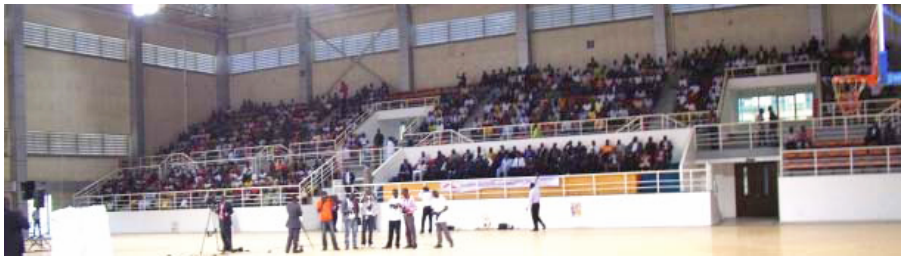
The picture shows a part of the great multitude in the stadium of Luanda, Angola.