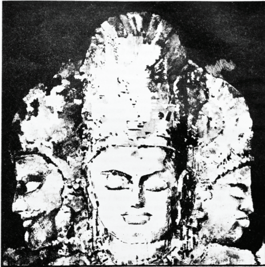
The Trimurti. A depiction of the Hindu Trinity: Brahma the Creator, Vishnu the Preserver and Mahesh the Destroyer.

To some it may be a surprise to see the ancient drawing of the Hindu Trinity. The human conceptions about God go back to the time of Nimrod and Babylon. It is inconceivable how these ideas were later adopted by Christendom. Whosoever really recognizes what the pictures doctrinally express will appreciate the clarification from the Scriptures, which is most urgently needed.